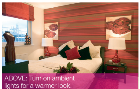
ABOVE: Turn on ambient lights for a warmer look.

Make the most of your property's potential. Contact XS Interiors for a talk through re the 'Style To Sell' furniture hire service and expect a great result! XS Interiors and EX Showhouse Furniture 0141 942 0519 Visit www.xsinteriors.com