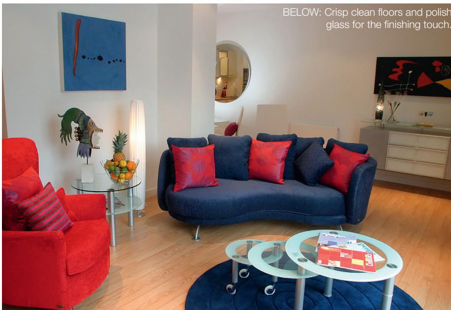
BELOW: Crisp clean floors and polish glass for the finishing touch.

Selling Your Property? Set The Stage For Potential Buyers.