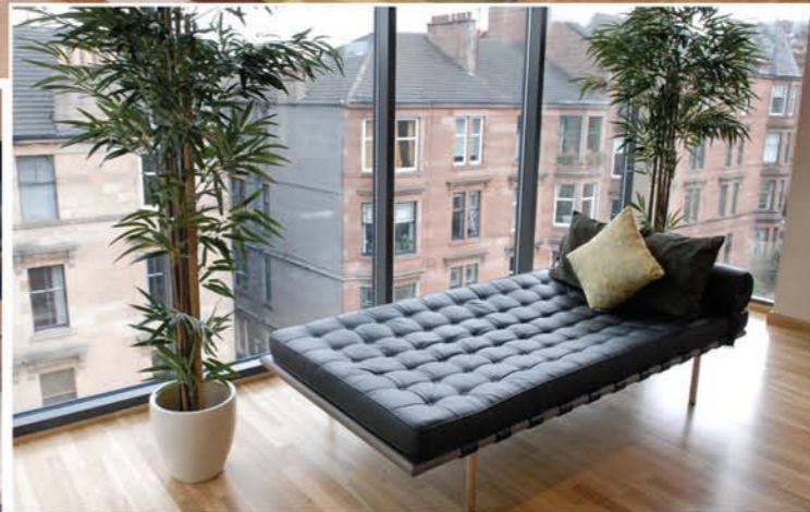
Above: Rent a penthouse. This top class rental property, owned by Cityscape Boutique Apartments, has three bedrooms and a fabulous private terrace with West end views plus further balconies overlooking the River Clyde. To rent call 0141 942 0519. Classic cinnamon suede sofas and a textured ponyskin chaise longue sit alongside sleek imported Spanish designer furniture and original oil on canvass art, all from EX Showhouse Furniture. Bespoke penthouse style is seen here with hand made bedding and curtains. The unique wallboard speaks volumes of originality.